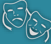
DRAMA & THEATRE STUDIES