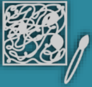
ART & DESIGN