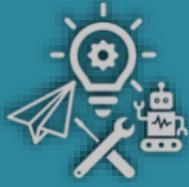
DESIGN & TECHNOLOGY