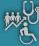
BTEC HEALTH & SOCIAL CARE