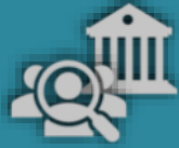
BTEC BUSINESS STUDIES