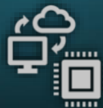
CAMBRIDGE TECHNICAL IT